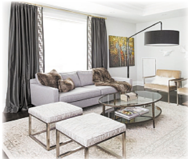
If you want to 'have your cake and eat it too,' combine drapes with sheers or shades for a different look.

— Sara Augenblick is principal of and a designer at Model Space Designs, a full service custom window covering design firm. For more information, visit www.modelspacedesigns.ca .